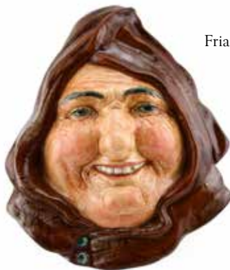
Friar of Orders Gray wall mask