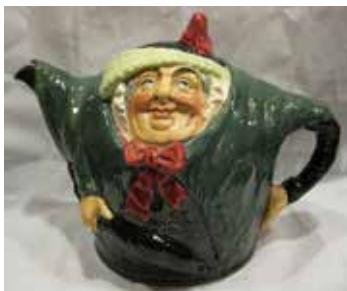
Sairey Gamp teapot