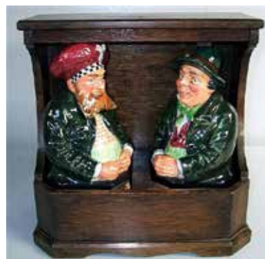
Whiskey decanter set with Scotsman and Irishman in oak tantalus