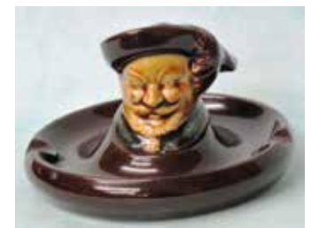
Falstaff stoneware prototype ash tray in Kingsware glaze