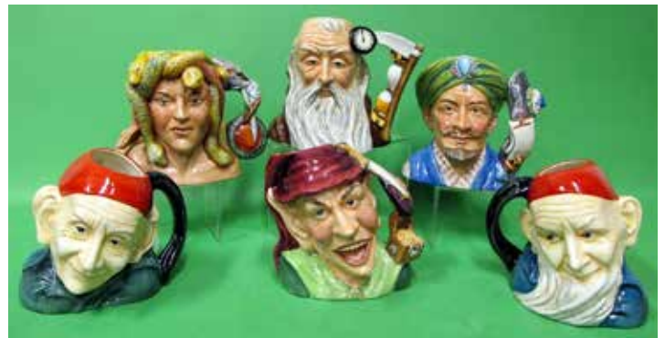
The Myths and Legends Series - proposed

Clockwise from upper left: Medusa, Old Father Time, Sinbad, Bearded Spook, Goblin, and Spook