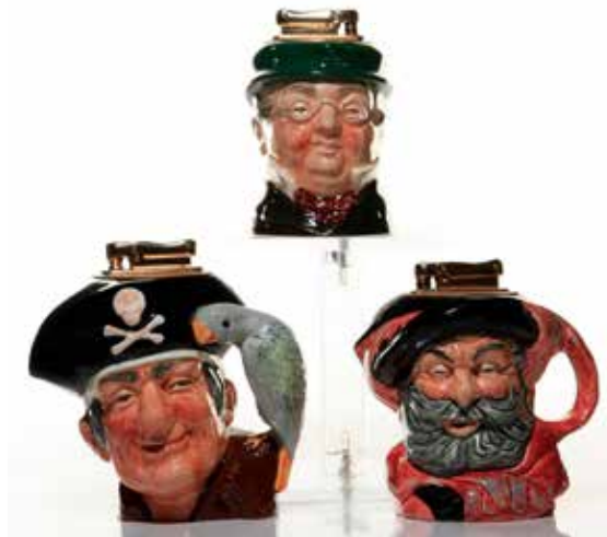
Lighters, clockwise from top: Mr. Pickwick, Falstaff, Long John Silver