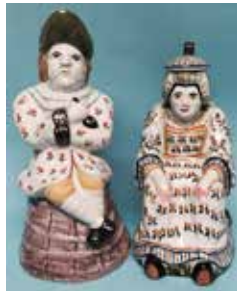
Jacquot and Jacqueline faïence pitchers

By the mid-1500s, small faïence pitchers in the form of a seated man or woman, called Jacquot and Jacqueline, became popular in France. These human shaped pitchers recall the romantic story of Jacqueline de Bavière, a courageous countess who escaped imprisonment by her cousin and arch rival to lead her troops and successfully preserve her heritable lands.