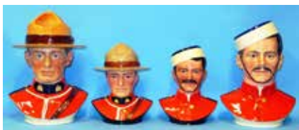
Canadian Mountie Busts, from left to right: R.C.M.P. 1973 prototype, R.C.M.P. 1973 production, R.C.M.P. 1873 production, R.C.M.P. 1873 prototype