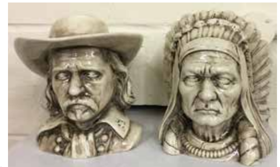
Custer and Sitting Bull prototype busts