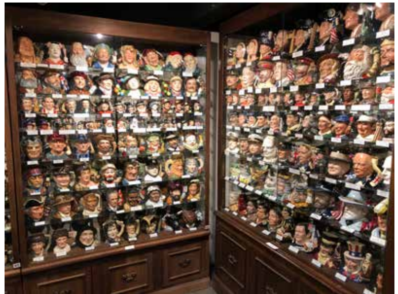
Royal Doulton prototype cabinets at the American Toby Jug Museum