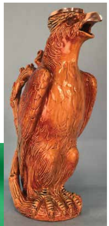
Eagle stoneware toby jug