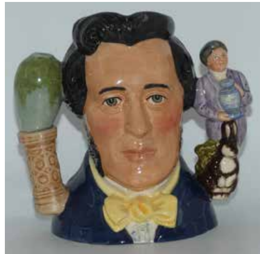
Sir Henry Doulton character jug