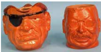
Stoneware character jugs: Highwayman (left) and Theodore Roosevelt (right)