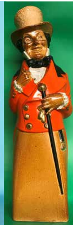
Johnny Walker stoneware bottle