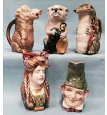
Group of French and Belgian majolica figural pitchers

Production of the figural Toby Jug grew through the late 18th and early 19th century with the creation of a wide variety of characters and derivative forms, including being produced in the beautiful Victorian majolica finish that swept the world after the 1851 Crystal Palace Great Exhibition in London.