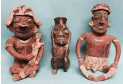
Examples of ancient bottles and pouring vessels circa 4000-2000 BC

Pottery figures over 6,000 years old have been found in Egypt and figural pitchers over 4,000 years old have been discovered in Crete, home of the Ancient Minoan civilization. Numerous examples of ancient jugs, cups, pots and other vessels made in the likeness