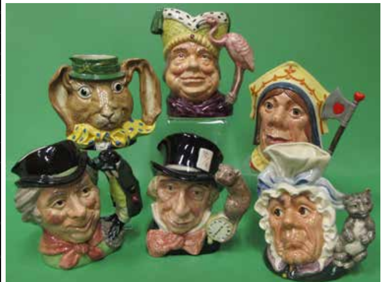
The Royal Doulton Alice in Wonderland character jug collection, clockwise from top center: Ugly Duchess, Red Queen, The Cook and the Cheshire Cat, Mad Hatter, Walrus and Carpenter, and March Hare