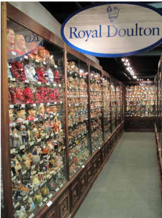
The Royal Doulton aisle at the American Toby Jug Museum