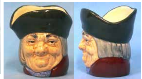
Toby Philpots prototype toothpick