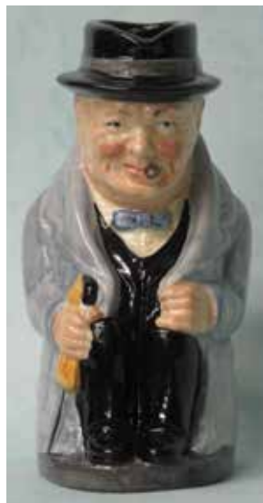
Winston Churchill toby jug in blue jacket