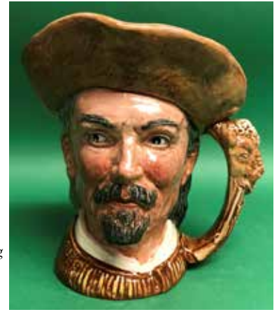
Buffalo Bill prototype character jug