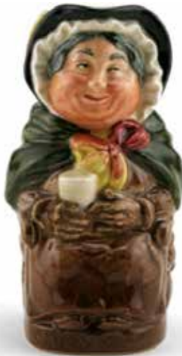
Sairey Gamp toby jug