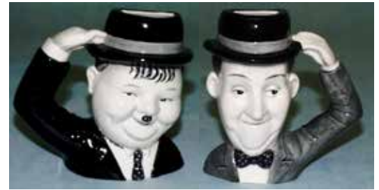
Oliver Hardy and Stan Laurel prototype wall pockets