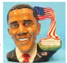
Barack Obama character jug produced 2011

Royal Doulton continued introducing new character and toby jugs up until 2011 when the company's fortunes took a turn for the worse and production was drastically scaled back and limited. Much to the dismay of collectors worldwide, the authors know of no plans for Royal Doulton to resume production of its character jug and toby jug lines.