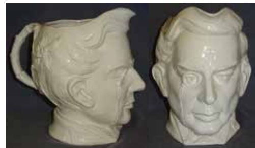
Doulton Joseph Chamberlain large stoneware character jug produced circa 1900

Royal Doulton was founded in 1815 by John Doulton in Lambeth, England. By 1926, Doulton & Watts as it was known then was one of the more important Lambeth potteries. Henry Doulton joined the firm soon after and was instrumental in driving exponential growth of the firm. Purchasing a Burslem factory in 1882, Doulton expanded operations to include bone china and decorative ware at the Burslem factory. In 1901 the company was granted the Royal Warrant, becoming Royal Doulton.