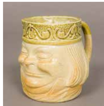
Old King Cole - version 1 stoneware character jug