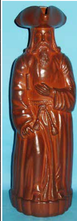
Orthodox Priest stoneware toby jug